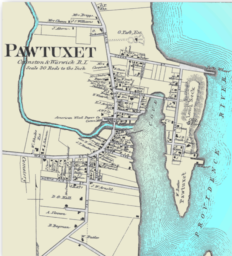
PAWTUXET, 1870 ("Pawtuxet Village Map," online at www.pawtuxetcove.com/Pawtuxet_Village_Map.html )